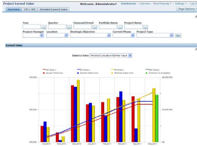
Figure 2. Earned value reports are automatically generated based on your dashboard filters.